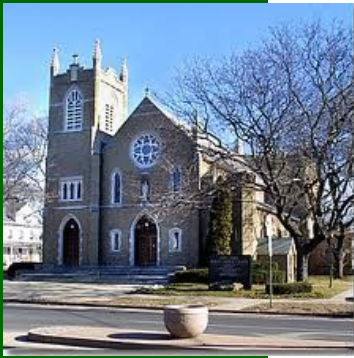
Saint James Church

"An education isn't how much you have committed to memory, or even how much you know. It's being able to differentiate between what you know and what you don't."